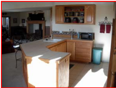
Wet bar with root beer tap!