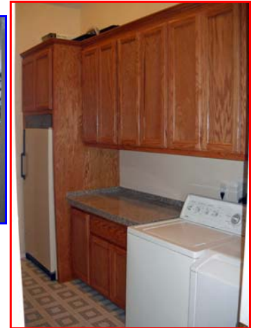
Huge laundry/pantry/mud room!