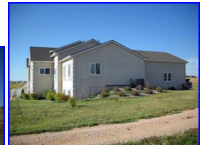
Low-maintenance stucco exterior!