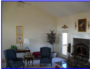
Formal living room w/high efficiency fireplace!