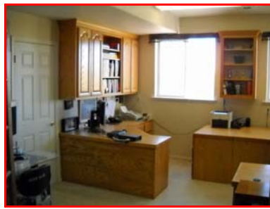
Office with twin desks, files, and supply/file closet!