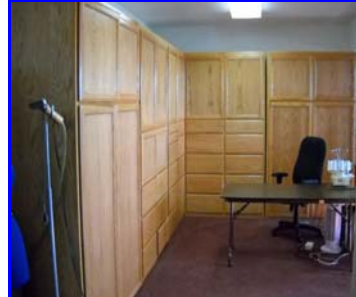
Huge workout/craft room with storage galore!