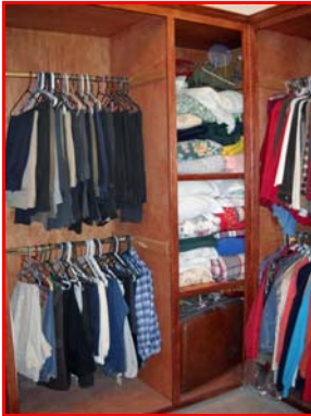
Master closet has built-in shoe rack, too!