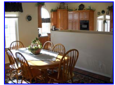
Sunny breakfast area!